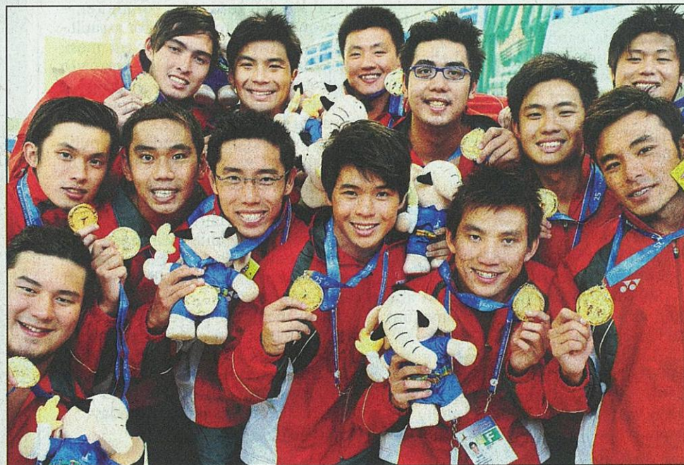
The Singapore water polo team members proudly wearing their gold medals, which were the first to be awarded at the South-east Asia Games in Laos.

Having been a member of six winning teams since 1999, he has decided to retire. "It's been a really emotional experience and it's starting to hit me now," he said as his voice broke slightly.